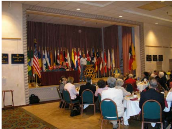
Keynote Speaker, Gary Johnson, former Governor of New Mexico.